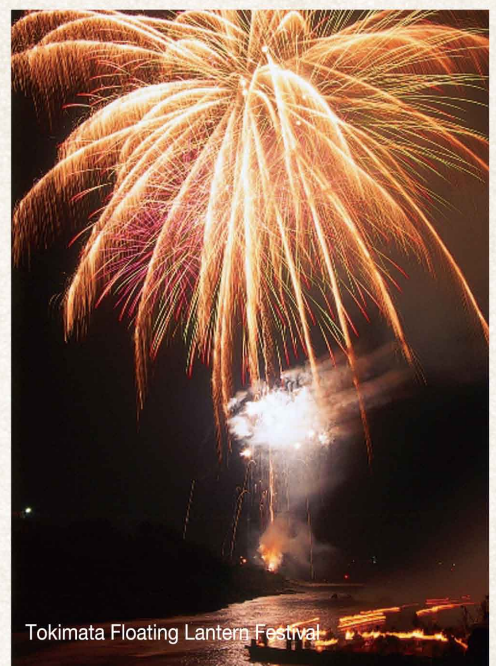
Tokimata Floating Lantern Festival

The largest local festival is the Oneri Festival, which is held once every 6 years. The highlights of the festival are Daimyo-gyoretsu, a reenactment of an Edo Period feudal lord’s procession, and Higashino Oshishi, a Shishi-mai dance by a giant lion more than 20 meters long.