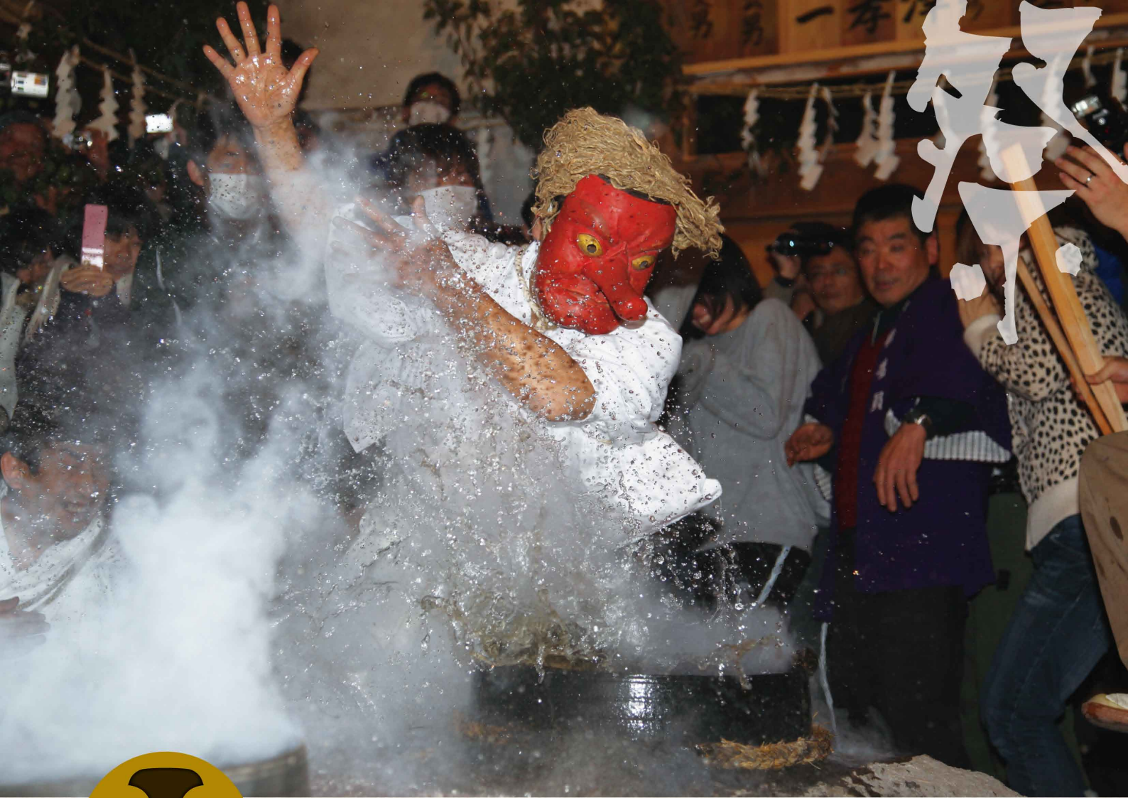
Toyama Shimotsuki Festival